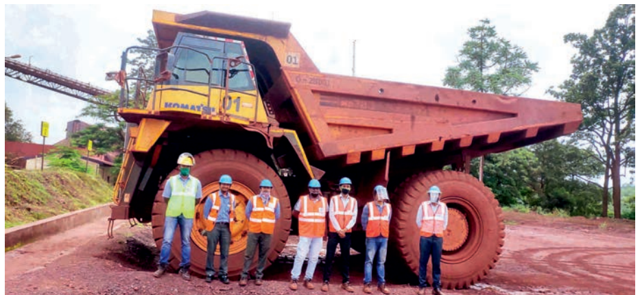
L&T-Durgapur team, which extended product support at site

As part of women's empowerment, Tata Steel has initiated 'Team- Agranee' as HEMM maintenance crew for the first time in mining history. Six girls with ITI qualification have been recruited by L&T and given extensive training in their Service Centre in Durgapur. They will be inducted soon in the OMQ Division, to take up maintenance activities.