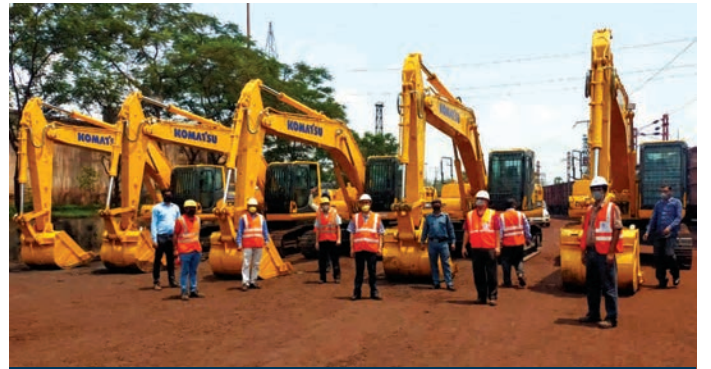
Handing over of Komatsu PC210-10M0 machines at NKCP site near Kolkata.