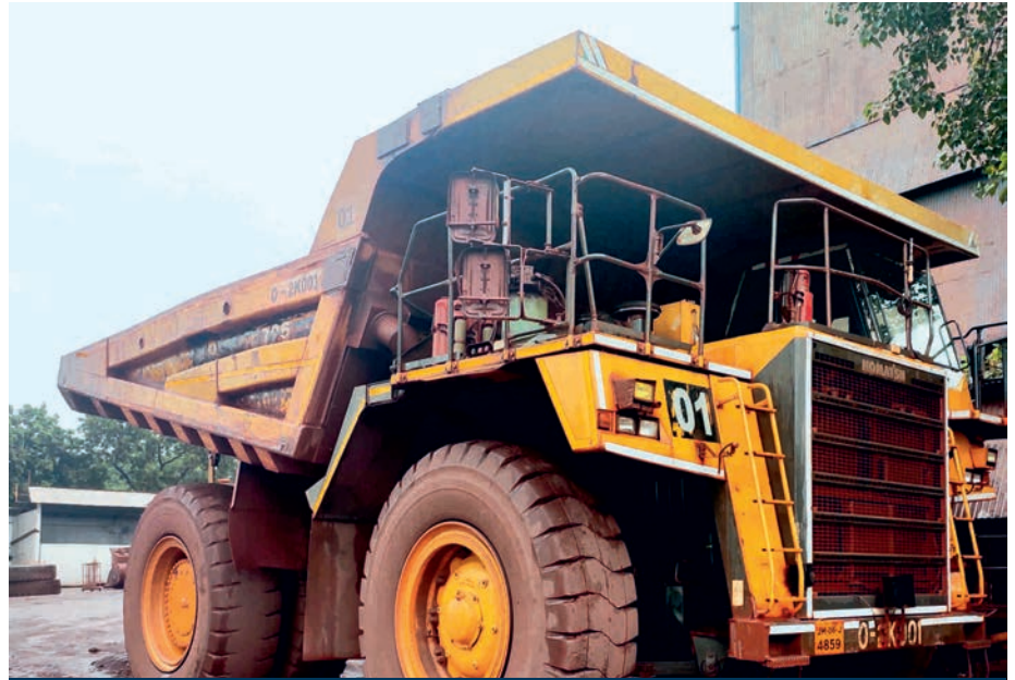
Komatsu HD785 – the star machine which created ripples in the iron ore industry with its impeccable performance!