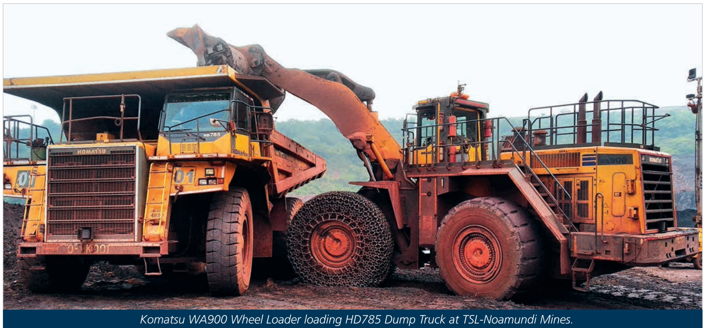
Komatsu WA900 Wheel Loader loading HD785 Dump Truck at TSL-Noamundi Mines.

In TSL sites, Safety is the key deliverable for each activity with focus on SOP. With L&T's track record of zero accident, TSL had awarded four-star rating in 2019 to L&T for continuous efforts and adherence of CSM standard in all OMQ mines. L&T works jointly with TSL to establish Noamundi