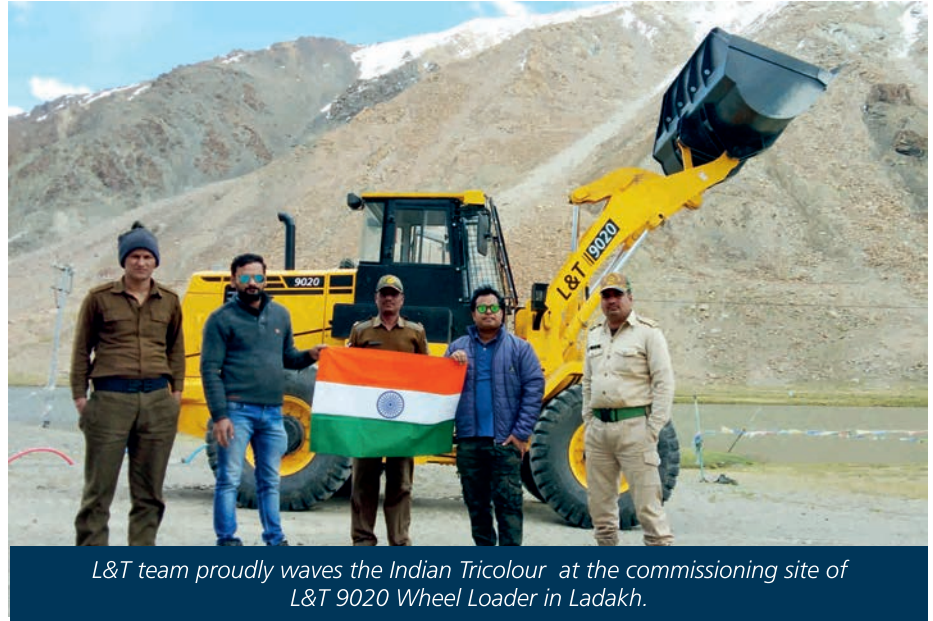
L&T team proudly waves the Indian Tricolour at the commissioning site of L&T 9020 Wheel Loader in Ladakh.

BRO projects are toughest in terms of the terrain, altitude, hostile climate and the remoteness of the sites. This is L&T's first foray into BRO for Wheel Loaders and will extend the after-sales support through its Dealers. L&T is proud to be associated with BRO and Indian Army, and in their efforts to build a solid defence against incursions across the border.